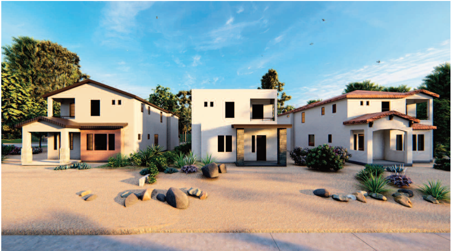
DESERT TERRITORIAL ELEVATION