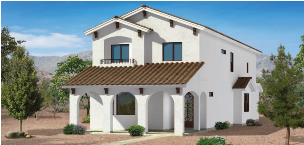
SPANISH MISSION ELEVATION