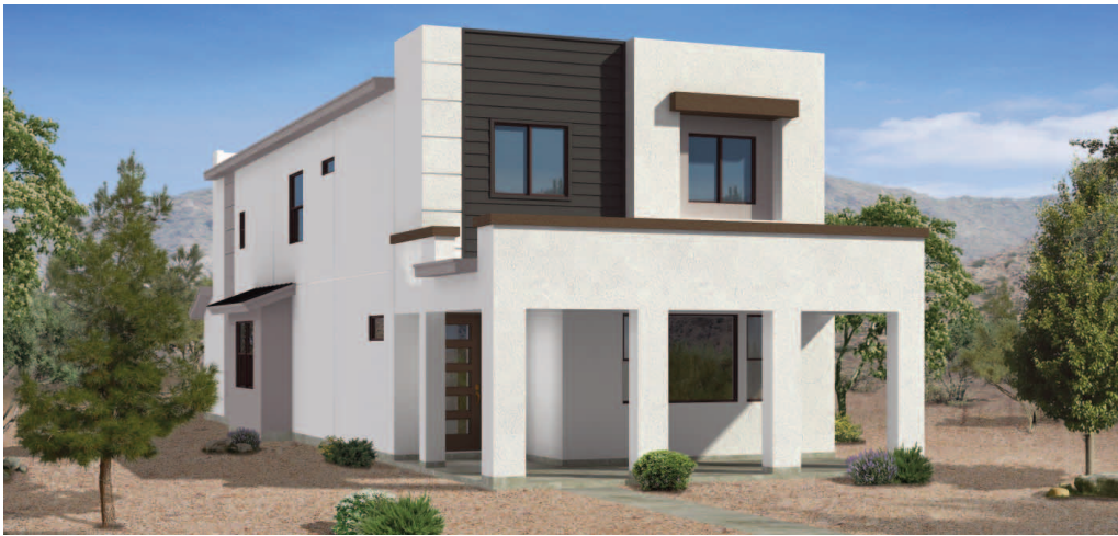
DESERT MODERN ELEVATION