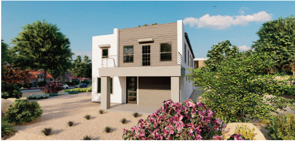
DESERT MODERN ELEVATION (SHOWN WITH BALCONY OPTION)