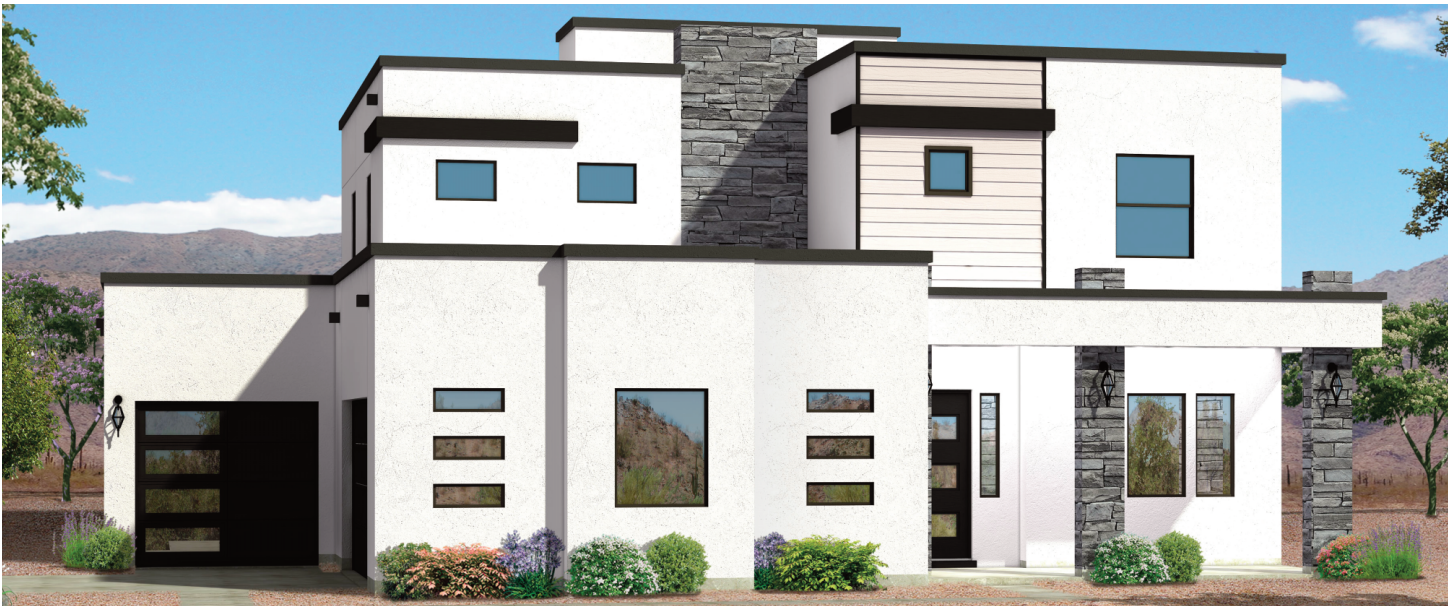
DESERT MODERN ELEVATION