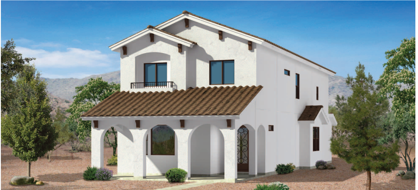
SPANISH MISSION ELEVATION