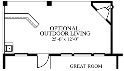
OUTDOOR LIVING AREA